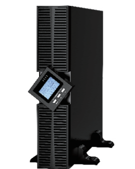
Display panel can be rotated